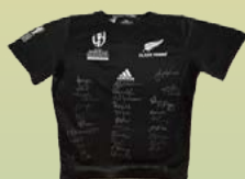
Black Fern's Signed & Framed RWC Jersey

Black Fern Jersey signed by the entire Women's Rugby World Cup (2021) winning team.