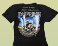
Willie Apiata (VC) Signed & Framed Iron Maiden T-shirt

An All Blacks jersey signed by all the remaining living Sir's who played for the All Blacks – Sir Wayne Smith, Sir Bryan Williams, Sir Wayne "Buck" Shelford, Sir John Kirwan and Sir Michael Jones.